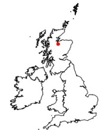
SITE LOCATION - NOT TO SCALE