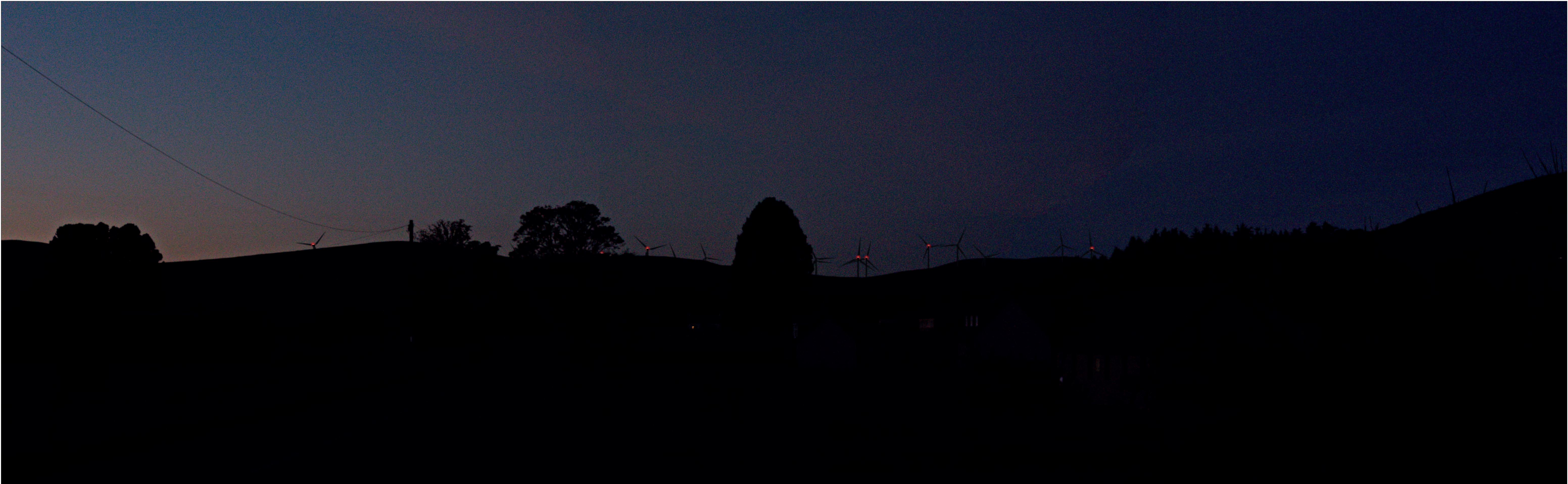
Night Time Photo montage - 2000 Candela