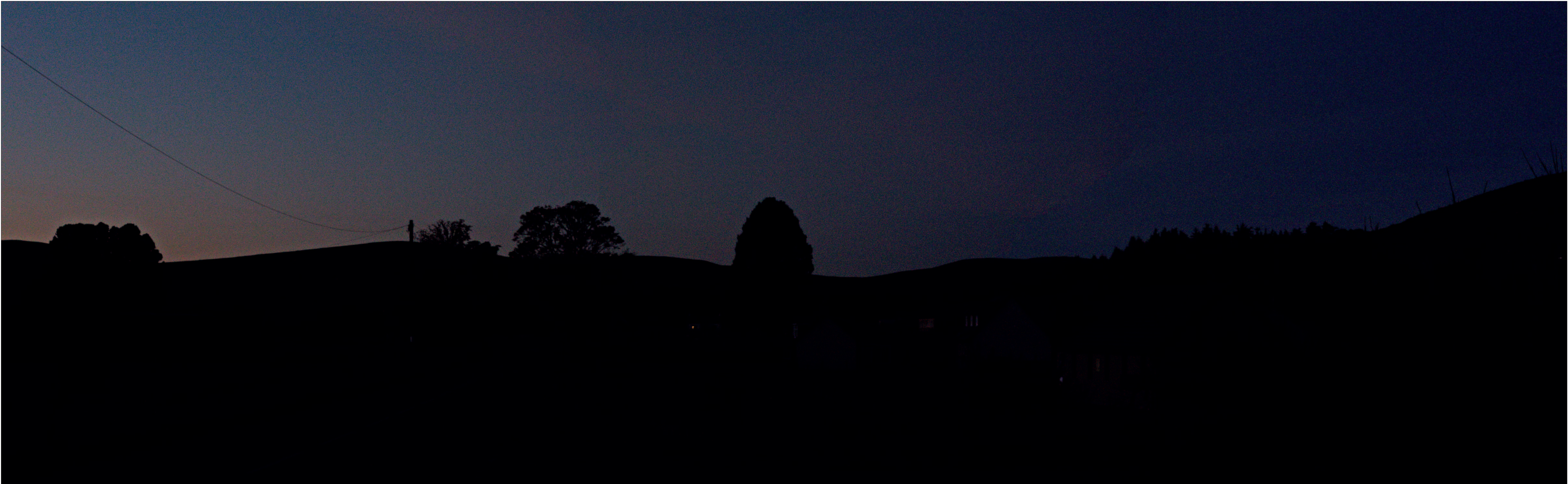
Night Time Baseline Photograph