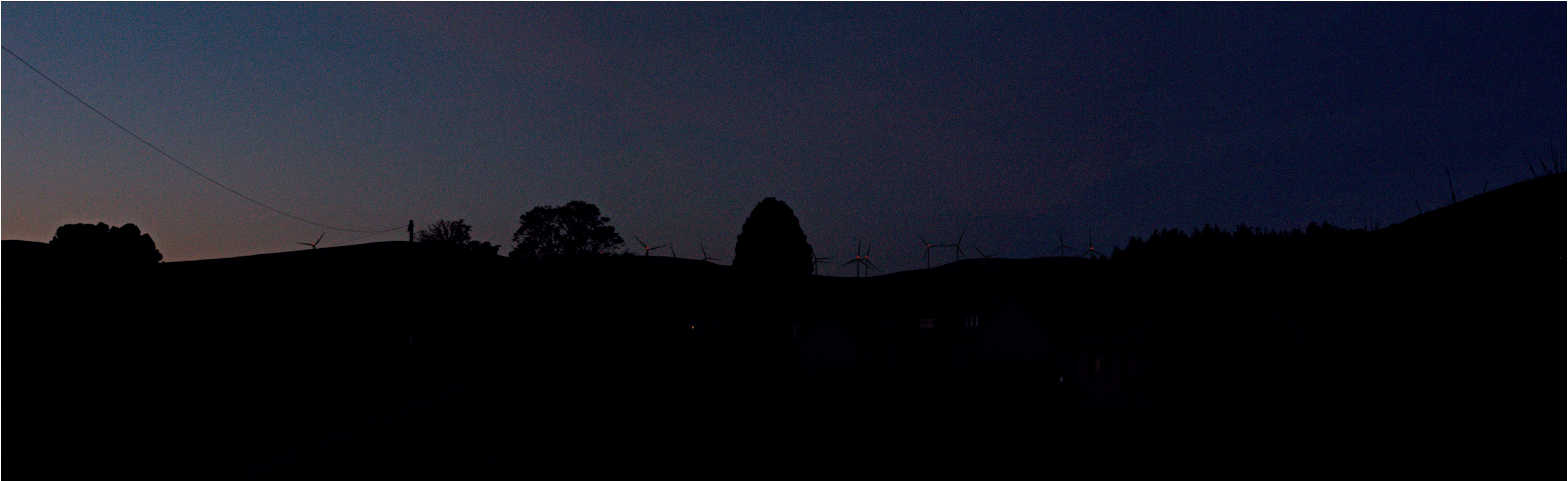
Night Time Photo montage - 200 Candela