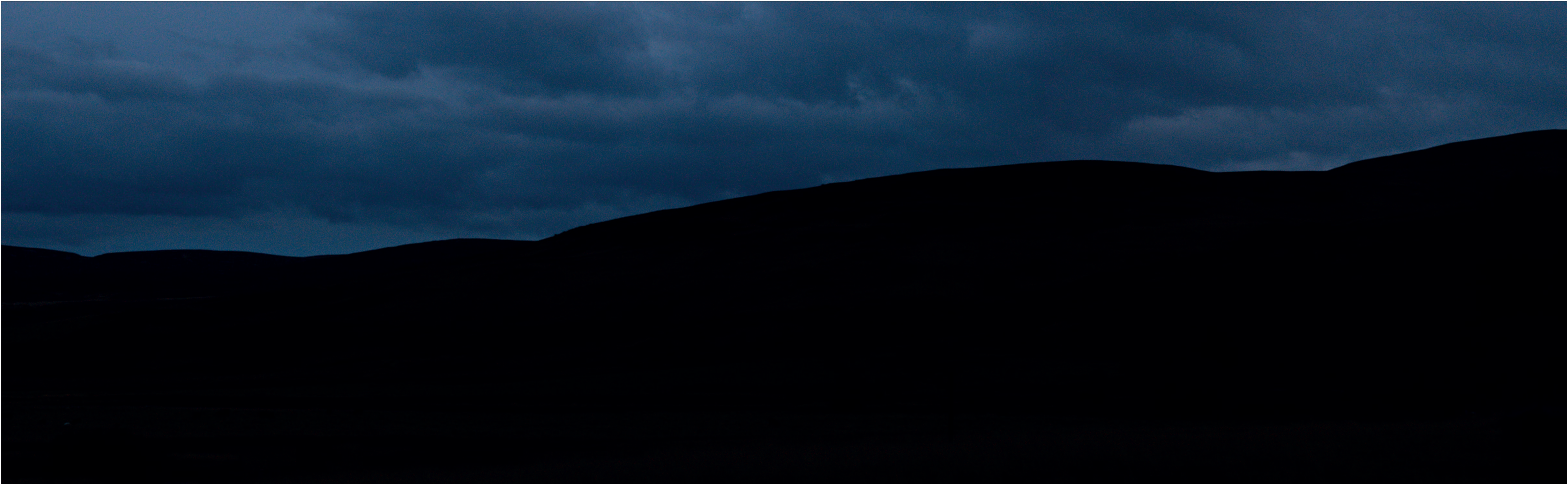
Night Time Baseline photograph