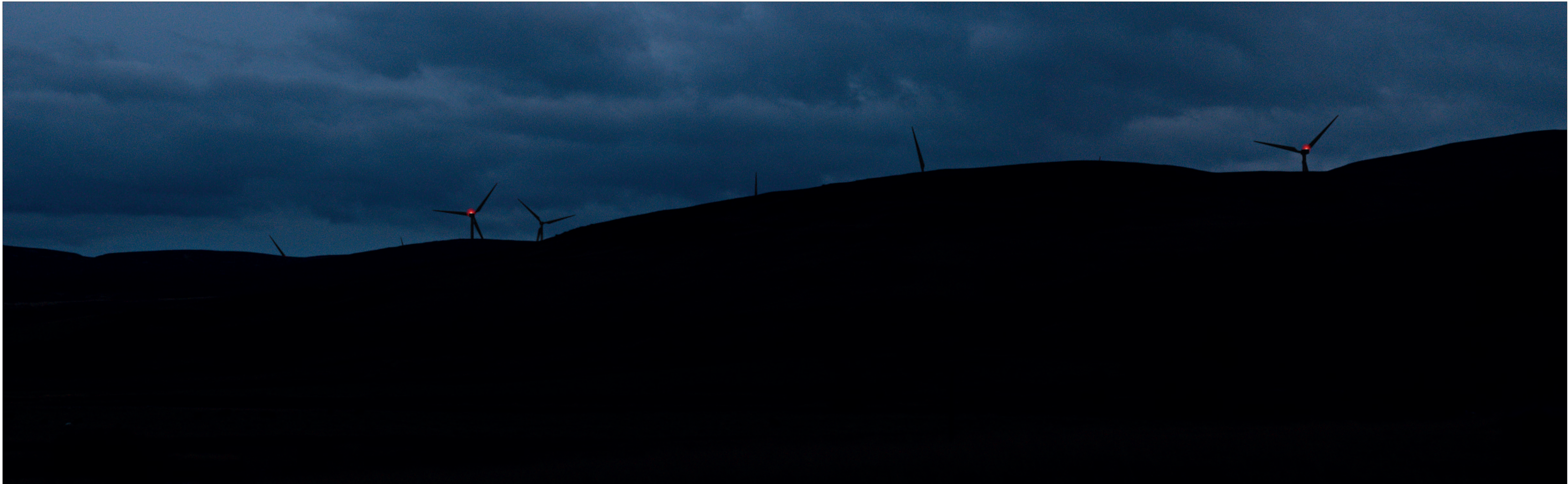
Night Time Photo montage - 2000 Candela