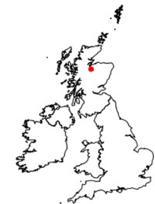
SITE LOCATION - NOT TO SCALE